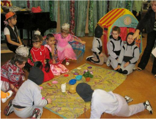
Mucha-Tsokotuha (Russian fairy tale)