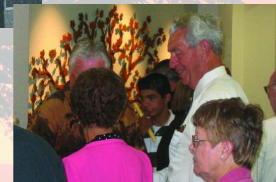
Friends crowd into our new lobby! Note new Bethany Tree!

“What a gift God has given our staff, our clients, and our community – through the generosity of our faithful friends and foundations!”