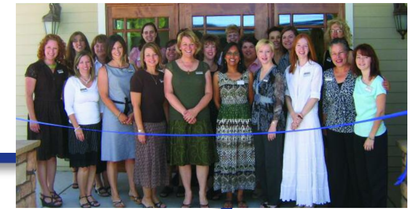
Northern California Staff – ready to cut the ribbon!