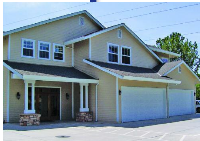
Our new office sits next to Bethany's House